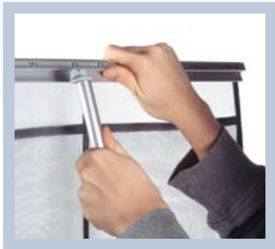
The smart construction of only three parts makes 4 Brochure exceptionally easy to assemble. Choose between four or eight compartments.

4-Brochure comprises of a brochure compartment on transparent fabric. The stand is easily rolled up and transported in a practical and discrete bag. The design is built on the same principle as the 4 Screen display system, highly stable and user-friendly. Weighs only 3.5 lbs.