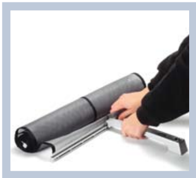
To dismantle, unhook the supporting rod and foot and roll up the brochure holder.